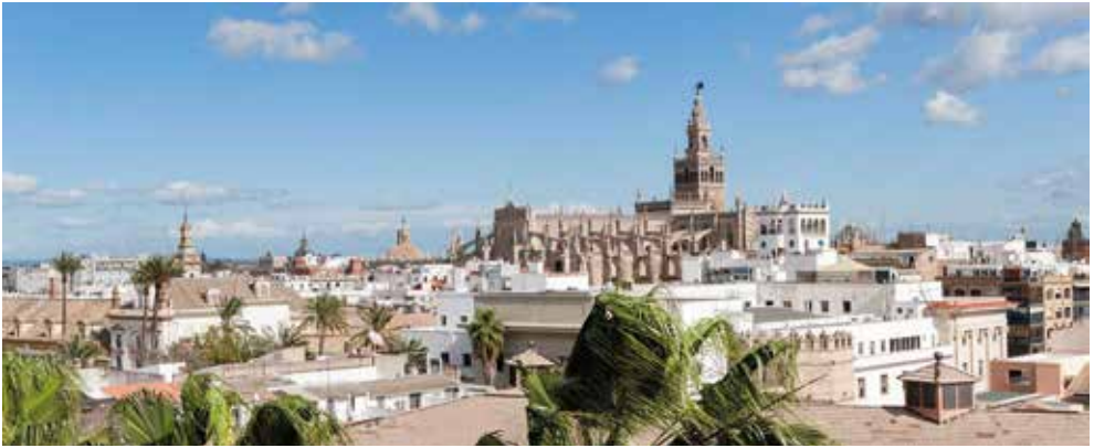
Panoramic view of Seville from the Schindler Tower.

the image of Seville projected through the arts, commemorative monuments, tourism and contemporary architecture, including the discourses and the evaluations of heritage protection policies and the press. Direct analysis, in this case, was confined to participant observation, surveys of key agents and the formal analysis of the city viewed statically and dynamically from a distance and at close range (Fernández-Baca, Fernández & Salmerón, 2015; 2017).