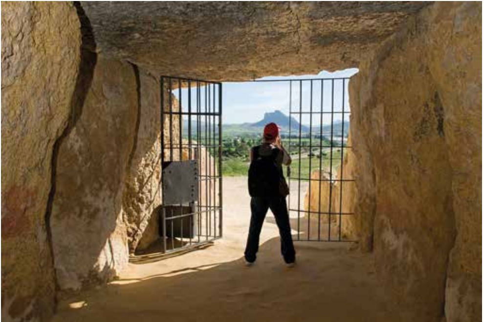
View from the Menga dolmen. Antequera Dolmen Archaeological Complex.

The Laboratory applied direct analysis in the study project on the landscape dimension of the Antequera Dolmens Archaeological Complex (Caballero et al., 2011; Durán, 2012). In this case, documentary sources were examined to discover the context and meaning of social discourses on the dolmens in the town of Antequera, a map of local agents was developed on a participatory basis, and participant observation, semi-structured and in-depth interviews and discussion groups were conducted. A technical assessment was also made of