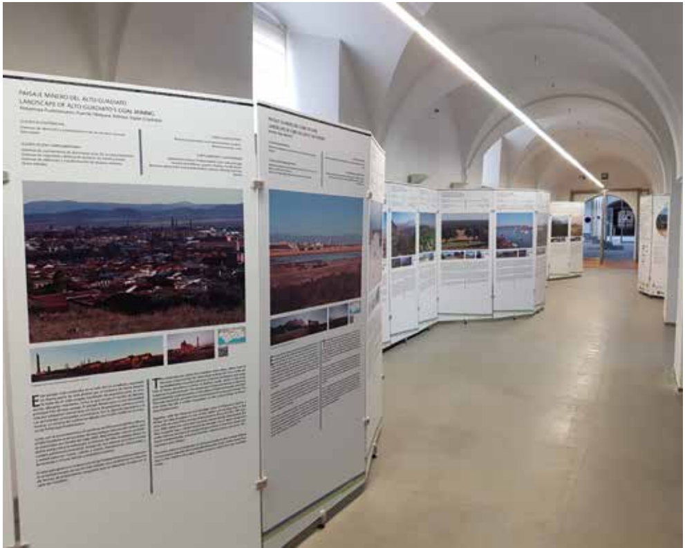
PAYSOC project exhibition.

Lastly, an on-site and virtual exhibition was also set up. The on-site exhibition ran at the IAPH from 15 th January to 31 st March 2021 and at the University of Seville School of Architecture from 4 th to 29 th April 2022. The virtual version was inaugurated on 8 th June 2021 in the framework of the Landscape Archaeology Congress 2020+1 , organised by the Centre for Human and Social Sciences of The Spanish National Research Council (CSIC) 7 .