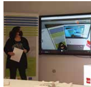
II Scientific meeting Discover cultural landscapes. Tenerife, July 2021.